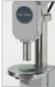
Shore D for sheet materials