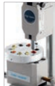
Rotofix with customized pattern