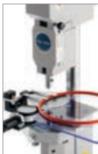
Barofix for large O-rings