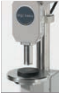
Shore A for sheet materials