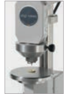
micro Shore D