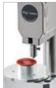
Sample fixture for rheology samples