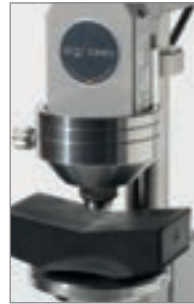
Shore A / B / O for finished parts