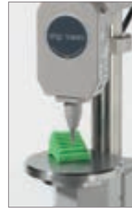
Shore D / C / D0 for finished parts