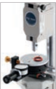
Barofix for O-rings