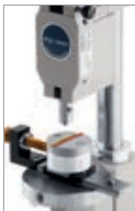
Centrofix for cables