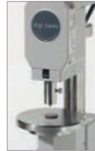
micro Shore A