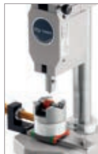
Centrofix for tubes