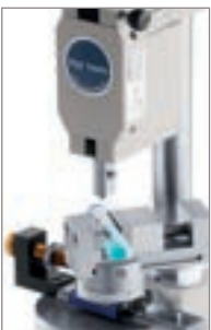
Centering device with vise