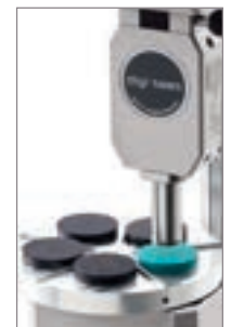
Rotofix for multiple rubber discs