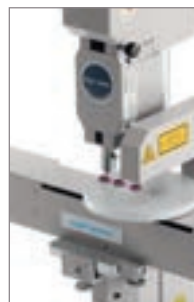
Laser-controlled positioning of O-rings