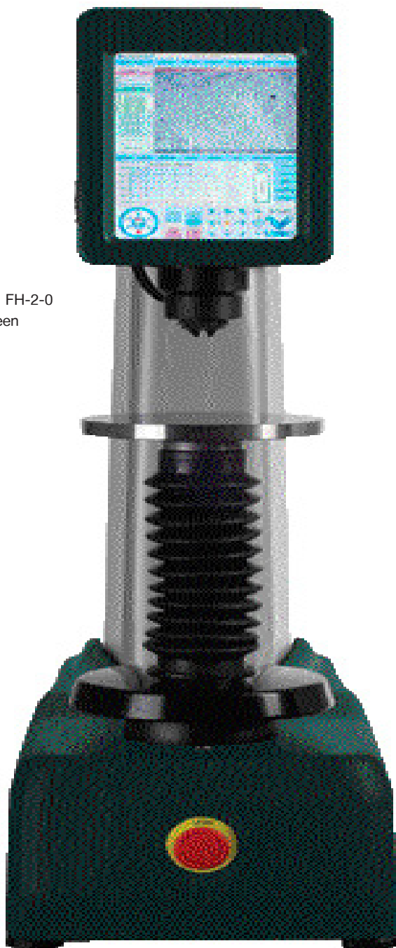
Fig. 1. Model FH-2-0 with LCD screen