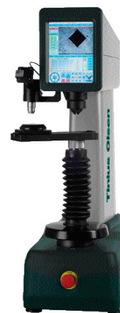
Fig. 2. FH-2-1 with built-on microscope