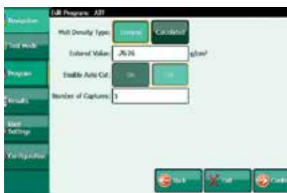
Program creation screen for automatic time flow and time basis tests.