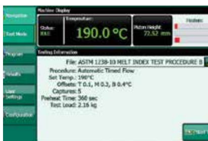
Home screen for manual MP1200