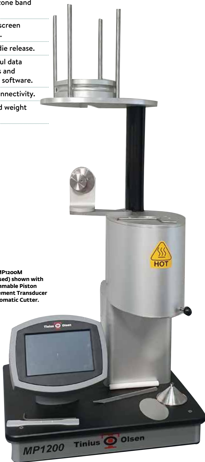
Model MP1200M (motorised) shown with Programmable Piston Displacement Transducer and Automatic Cutter.